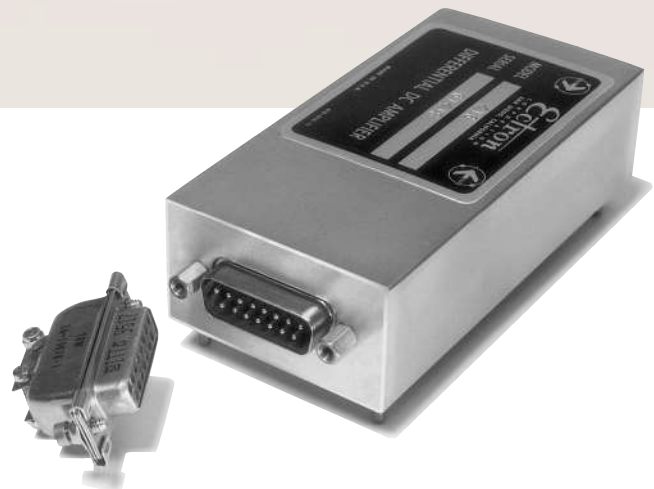
Model 416 rear view, with mating DAM-15S connector