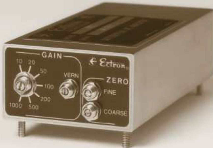
Model 416 front view. See specifications for size.